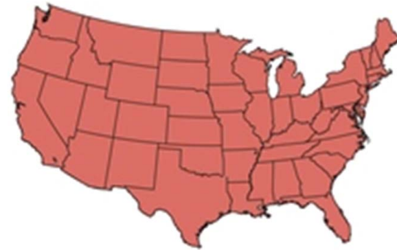
State – 25%