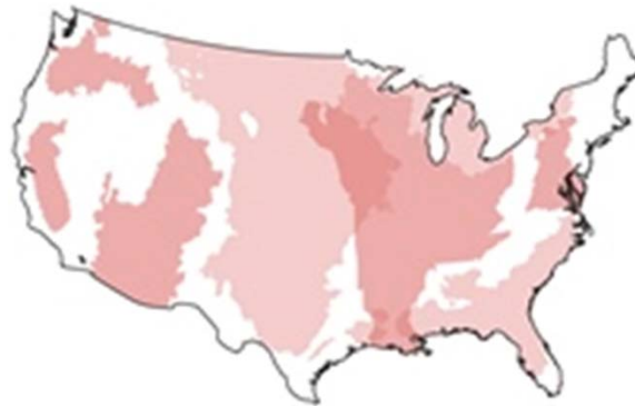
Critical Conservation Area (CCA) - 35%