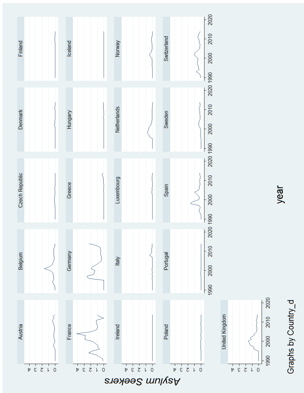
Figure B.3: Annual African Asylum Seekers in Europe from 1990-2014. Source: Authors' calculations based on data described in text.