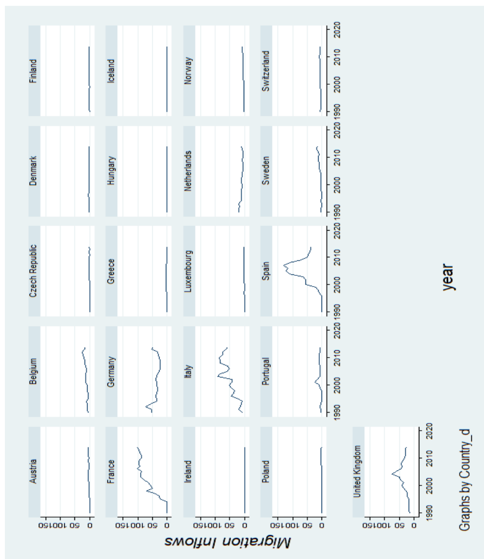
Figure B.1: Annual African Migration flows in Europe from 1990-2014. Source: Authors' calculations based on data described in text.